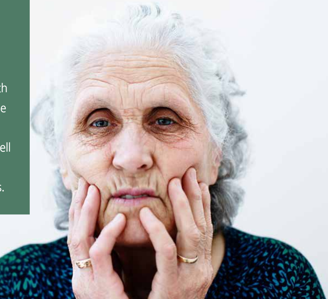
(Delirium in a Hospitalized Elderly Patient, continued from page 11)

Delirium is associated with a 60% increase in one-year mortality, as well as increased hospital costs.